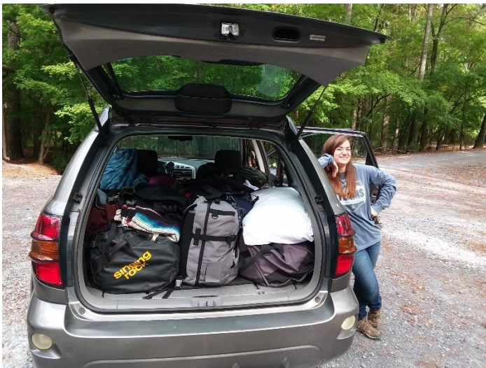
My car was packed for our camping trip to Chester Frost Park!