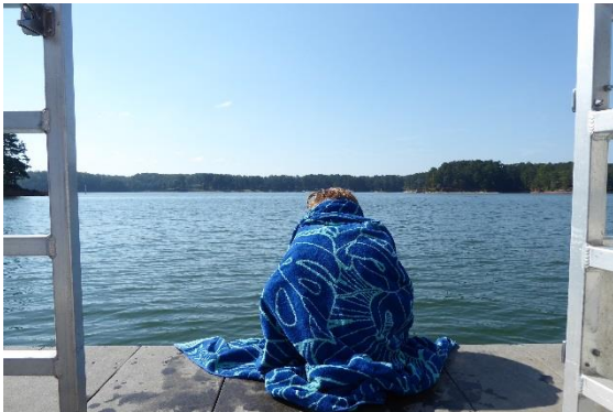
A trip on the boat