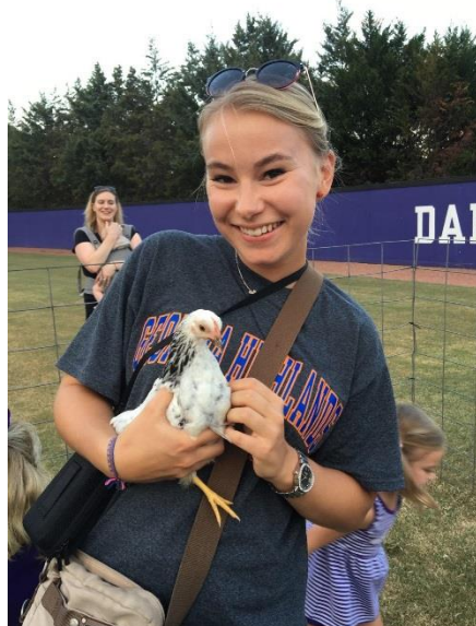
I felt like a child!