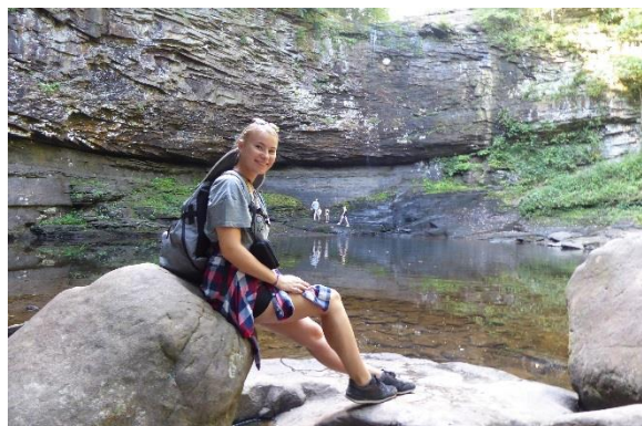
Labor Day Weekend