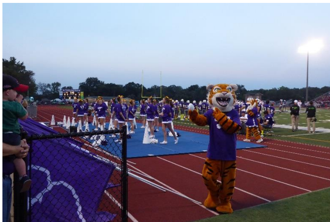
Football Game of the Darlington Tigers