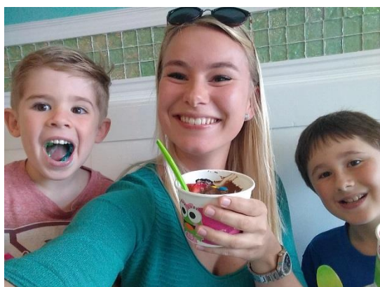
My first Frozen Yoghurt!